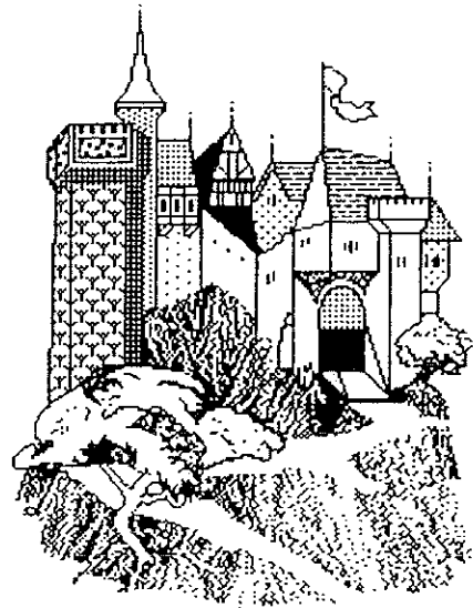
Your Tax Assessor